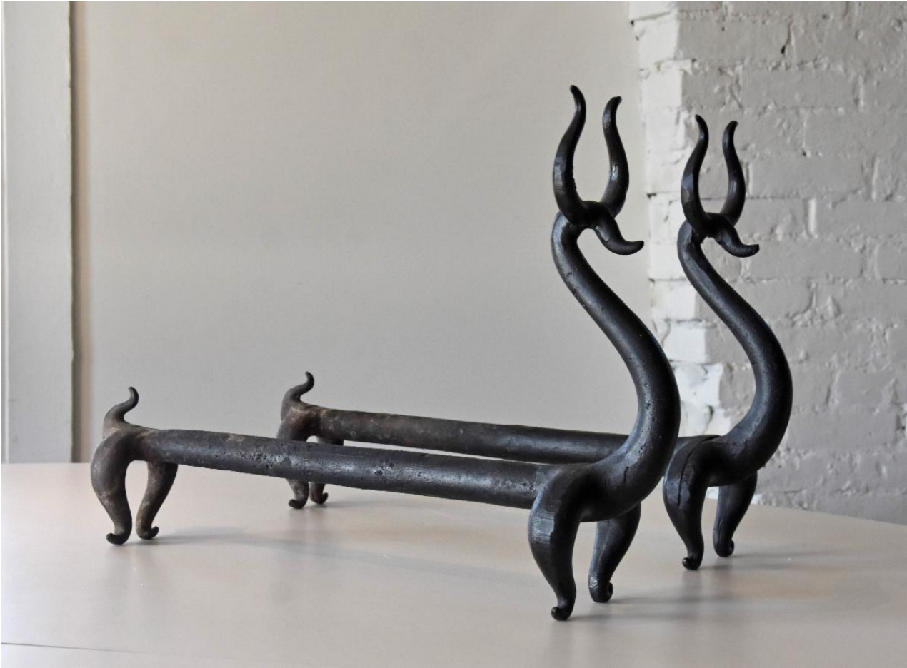
from Russel Wright's Circus: FIREDEER, andirons, 1930