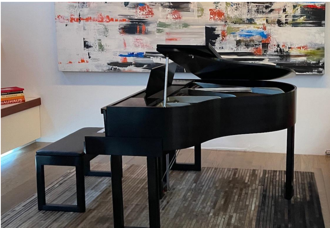
Wurlitzer Baby Grand Piano by Russel Wright, 1934